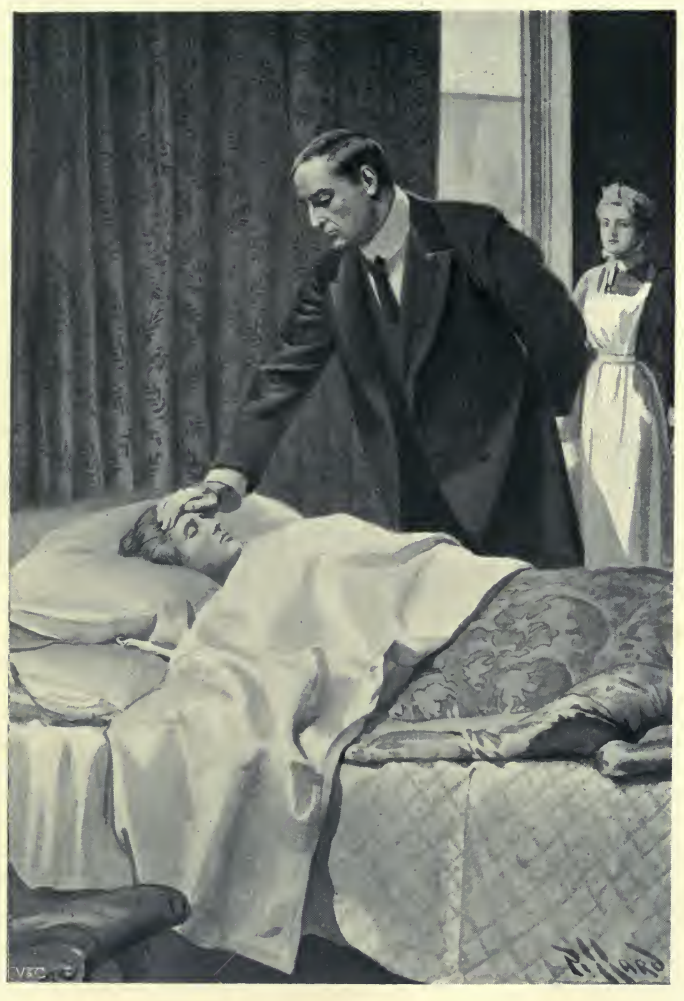
"He laid his hand upon her forehead."